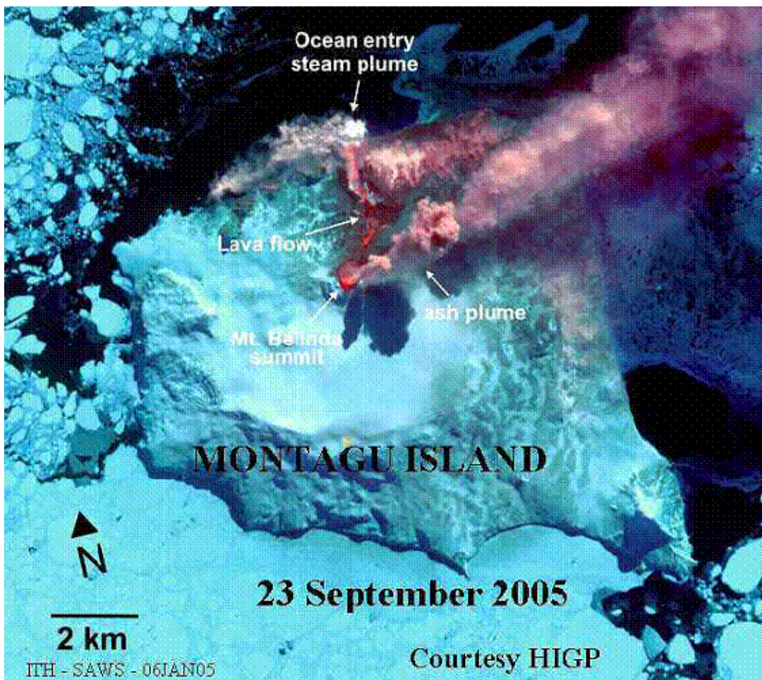
Image ex ASTER (Advanced Spaceborne Thermal Emission and Reflection Radiometer) – flying on NASA's TERRA satellite

This is a photo taken of the erupting Mt Belinda on Montague Island - South Sandwich group - September 2005 :